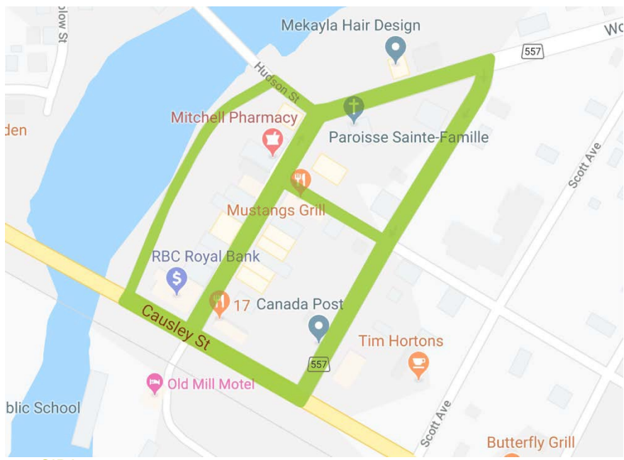
FIGURE 1 - DOWNTOWN CIPA

CIPA - The area considered to be located within the Downtown Core including Provencher Lane to the West to Lawton Avenue to the East.